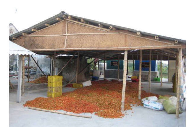
Figure 3. Cherry tomatoes waiting for processing