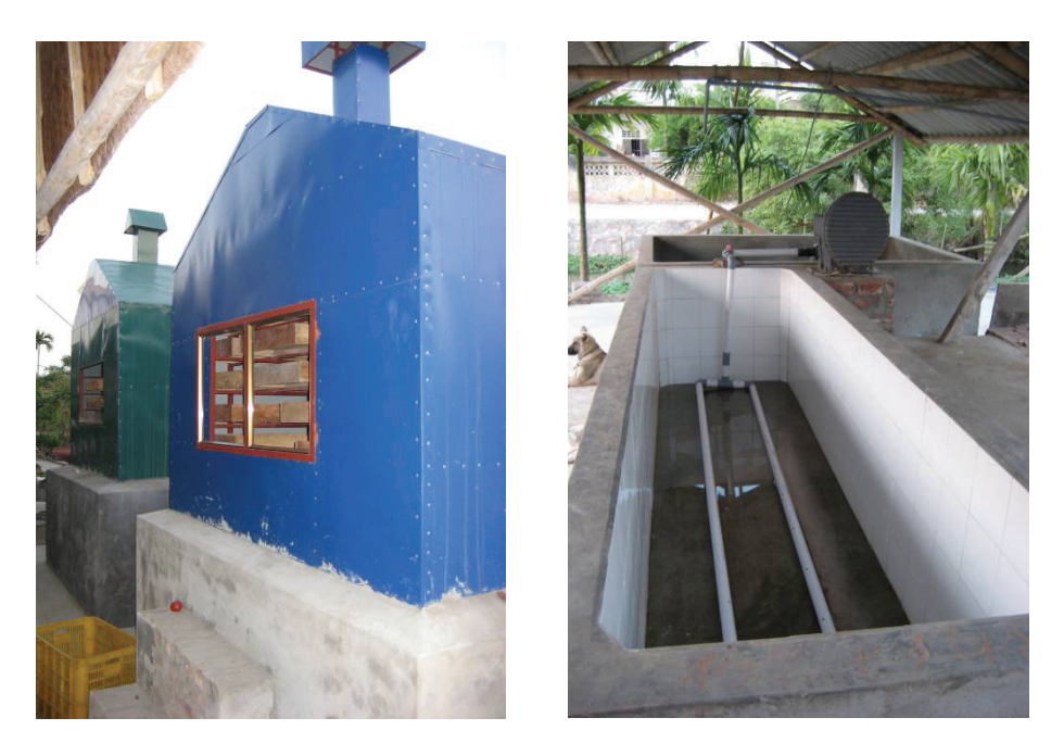
Figure 4. Solar dryer (I) and washing tank (r) in the processing plant